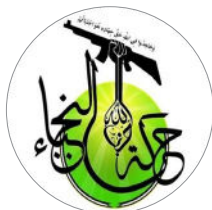
Harakat Hezbollah al-Nujaba'