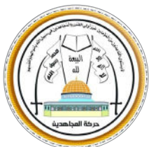
Palestinian Mujahideen Movement