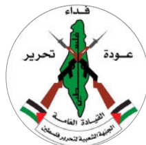
Popular Front for the Liberation of Palestine – General Command