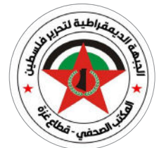
Democratic Front for the Liberation of Palestine