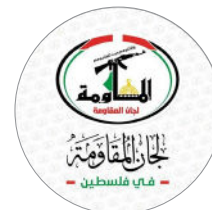
Popular Resistance Committees