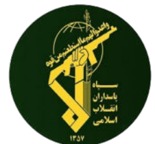
Islamic Revolutionary Guard Corps – Quds Force