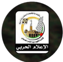
Abd Al-Qadir Al-Husseini Brigades