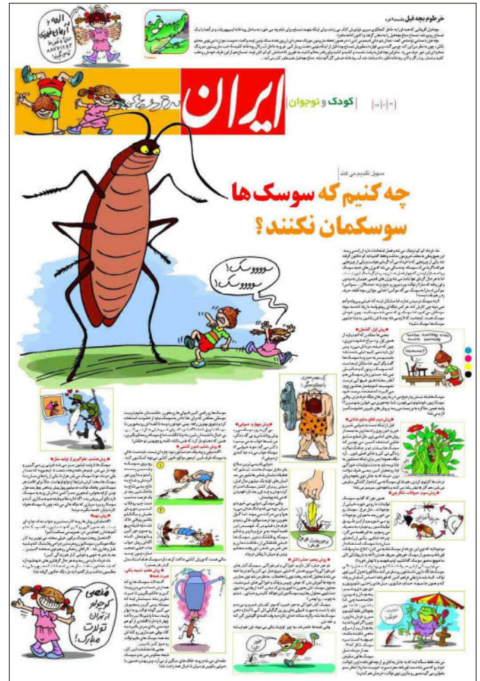
Cockroach cartoon in Iran, May 12, 2006.

In addition, university students conducted a letter-writing campaign to the offices of Iran’s president, the Majles, the Friday sermon leaders, and the governors of East Azerbaijan, Zanjan, and Ardabil provinces. The letters condemned the survey and called for the right to use and study the Azerbaijani language at Tabriz University. 70