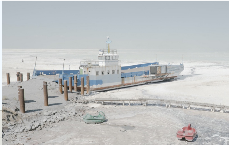
⬆ L: Map of Lake Urmia; R: An abandoned ship stuck in Lake Urmia

and activities by young people to protect Kurdistan’s nature. Local residents also self-organize for firefighting to protect the region’s forests and wildlife.