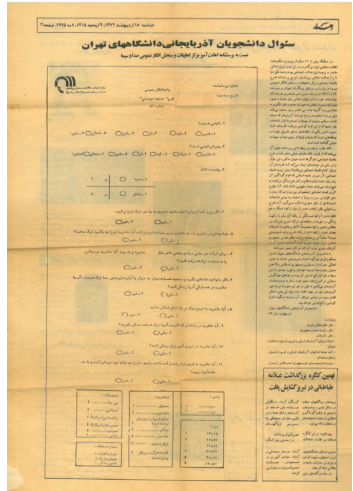
IRIB Survey Questions