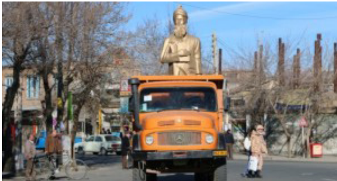
📍 The government removes a Ferdowsi statue in Salmas following protests in 2015.

province, noted that despite these government efforts, 40 percent of names in the province are Turkic ones. 24