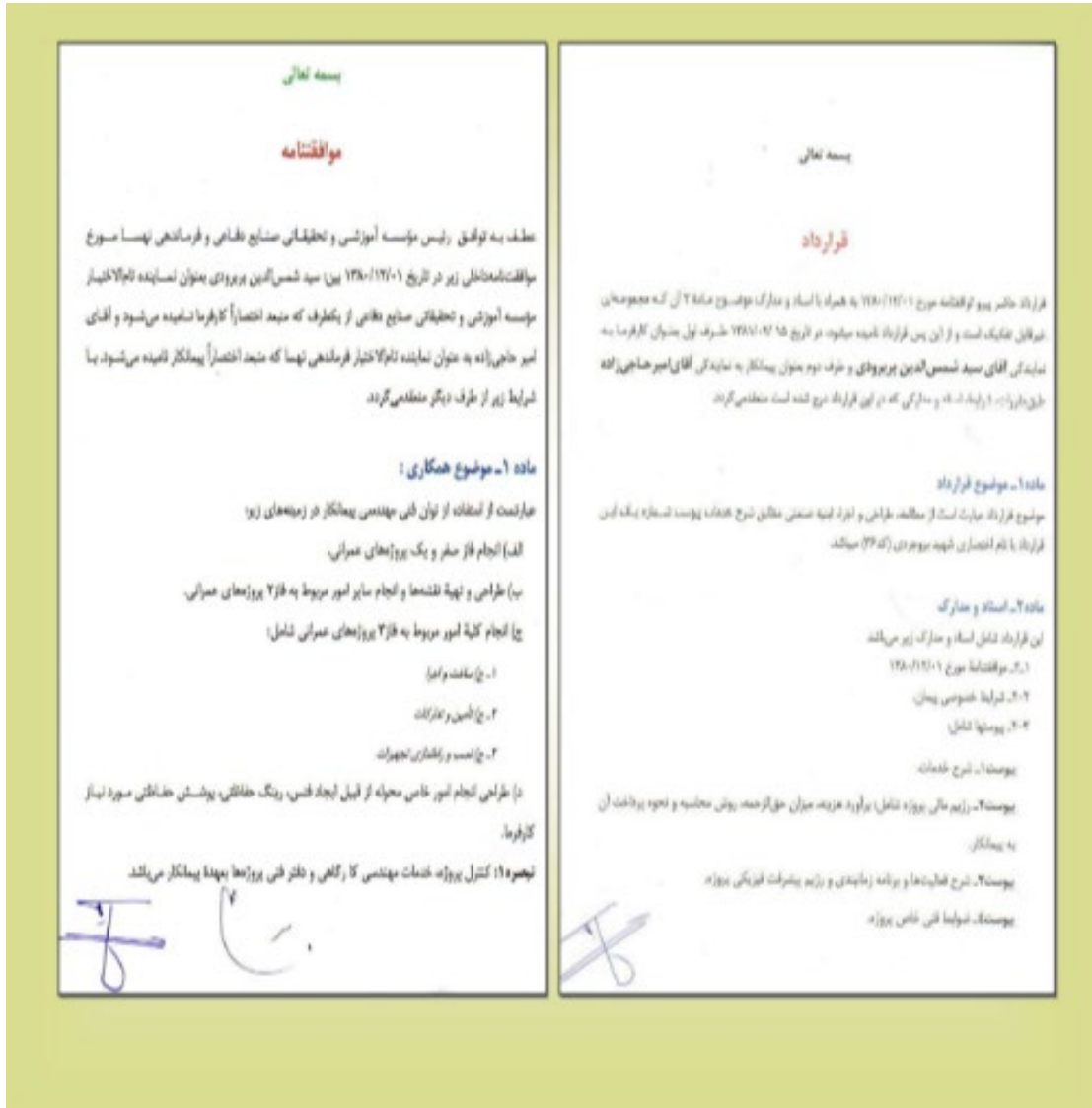
Figure A1.1 Cover of Contract and Agreement